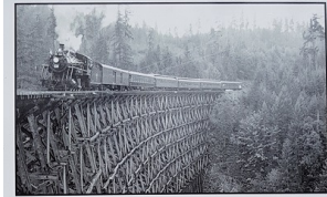
Working Railway Trestle