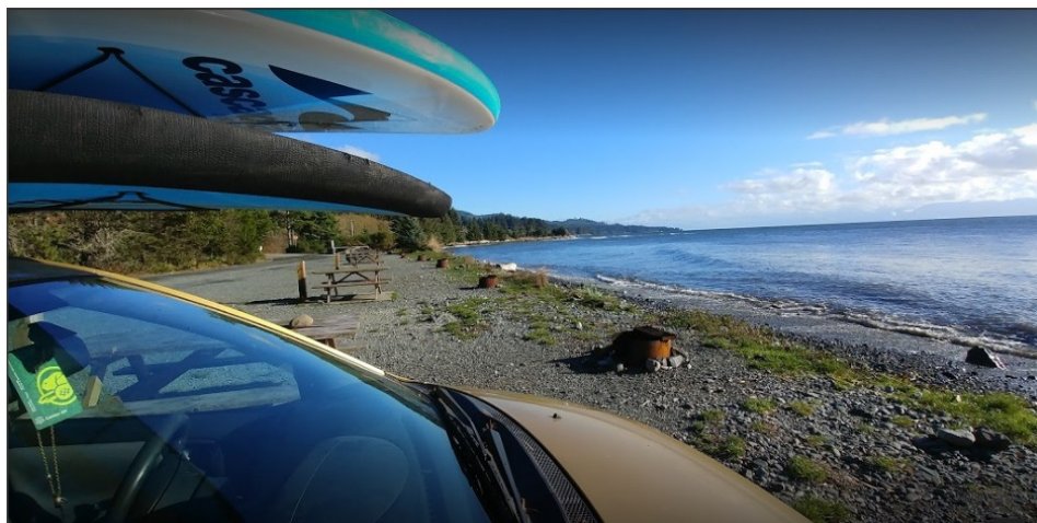
Gina Hill from Google Images