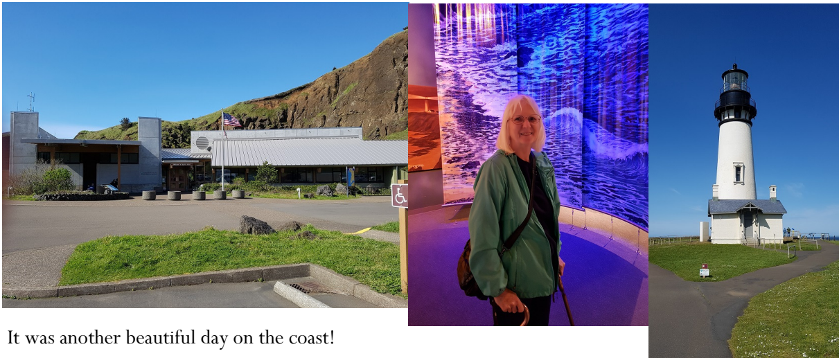
It was another beautiful day on the coast!

The sun was shining again this morning - time to get out and enjoy the lack of rain. On the way into Newport, we visited the Yaquina Head Outstanding Natural Area. We toured the Visitors Centre then drove to the lighthouse.