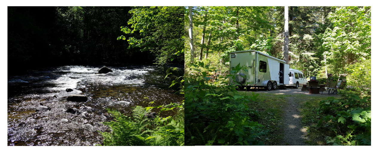
Tomorrow we're heading for Strathcona Provincial Park. There are a number of waterfalls in the park that are easy to get to. Hopefully we can see one or two of them without tiring Jen out too much. See you then.

After coffee we drove to Quinsam Campground just west of Campbell River in Elk Falls Provincial Park. We stayed here last fall. We lucked out and pulled into site #6 on the Quinsam River. We had a short stroll to the river itself, but the sound of the running water was very therapeutic.