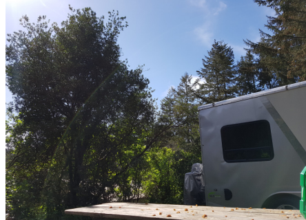
Once we had set up camp, we went for a walk and saw this from the top of the bluff.