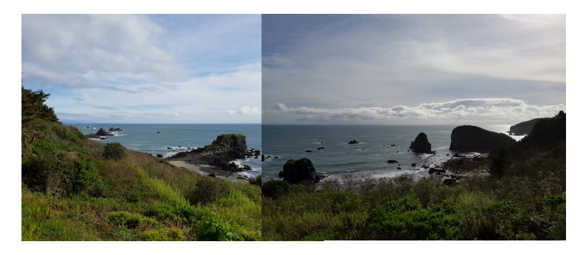
Tomorrow we will explore more of Brookings.