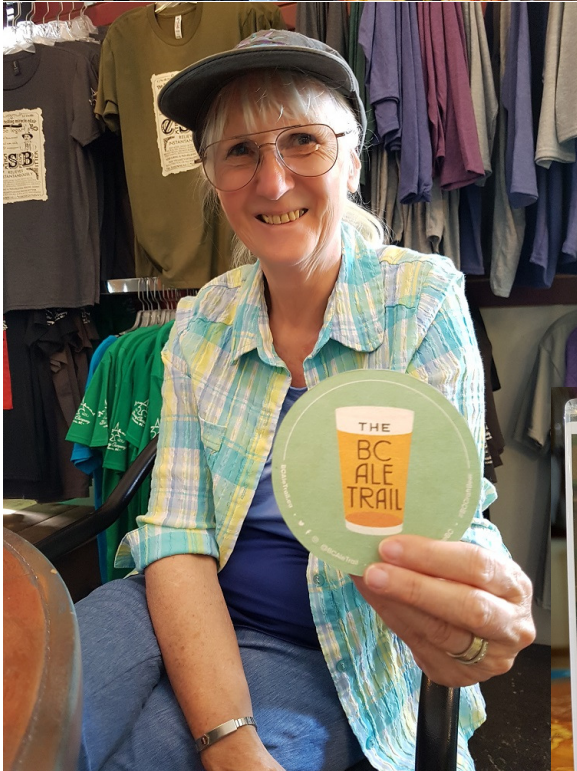
Lookit this: All the way in Invermere, BC, a little bit of down home, Nova Scotia style. We will return Saturday!