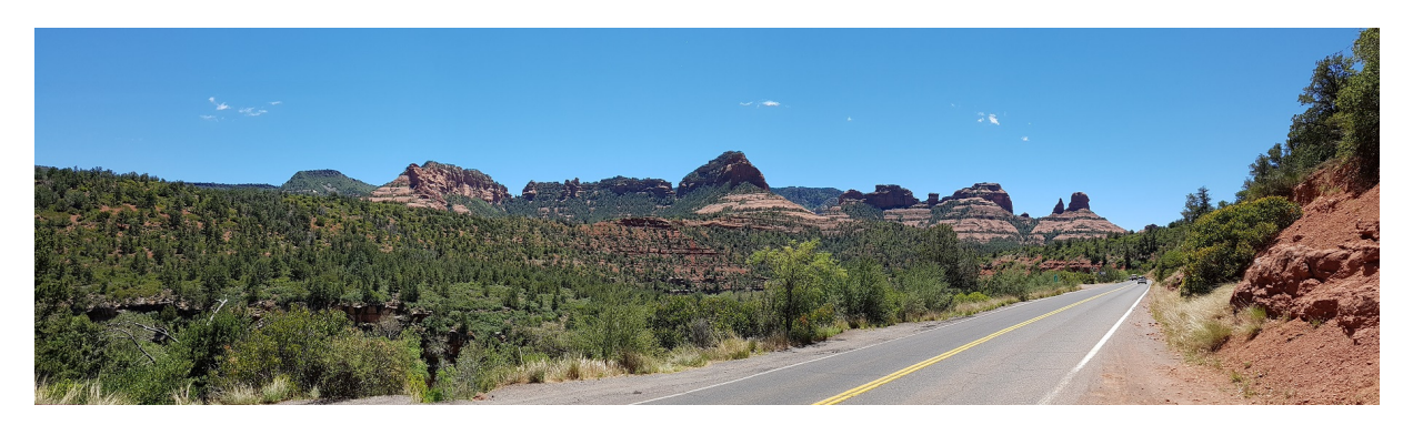
The first appearance of humanity was Uptown Sedona. We stopped at the tourist centre to inquire about campsites, etc. Turned out the one RV park in town was full.