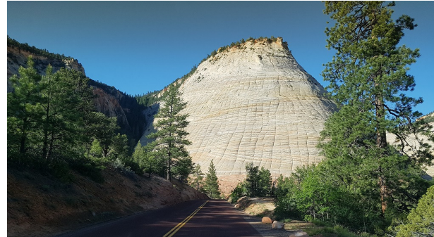
This is "Checkerboard Mesa" a prominent example of naturally sculpted rock art.