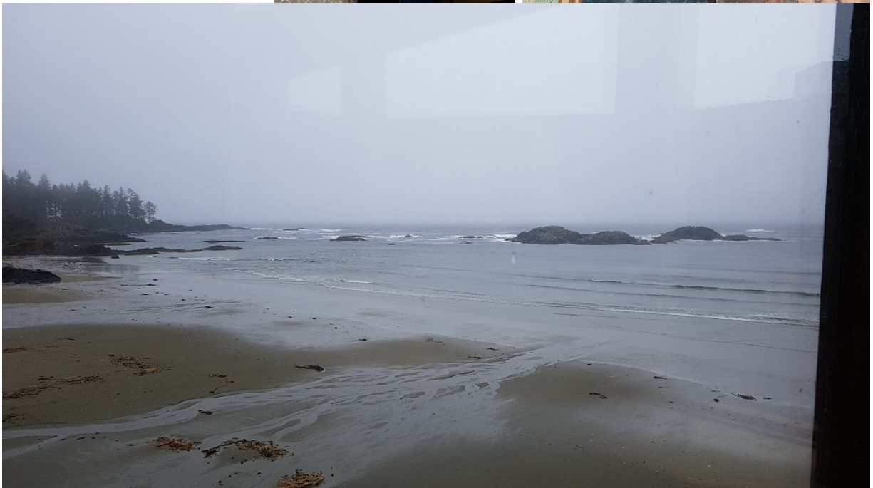
If the weather forecast is correct, tomorrow you'll find us on a beach somewhere. See you then.