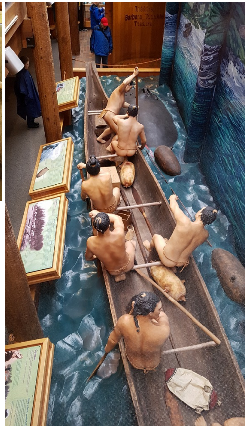
From the second floor, we enjoyed the view.